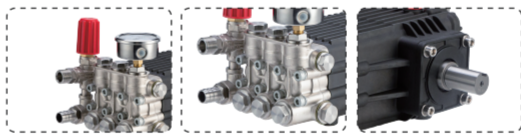
Control valves All copper, nickel-plated pump heads Crankcase