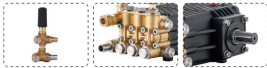
Control valves All-copper pumphead Crankcase