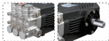
All copper, nickel-plated pump heads Crankcase