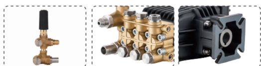
Control valves All-copper pumphead Crankcase